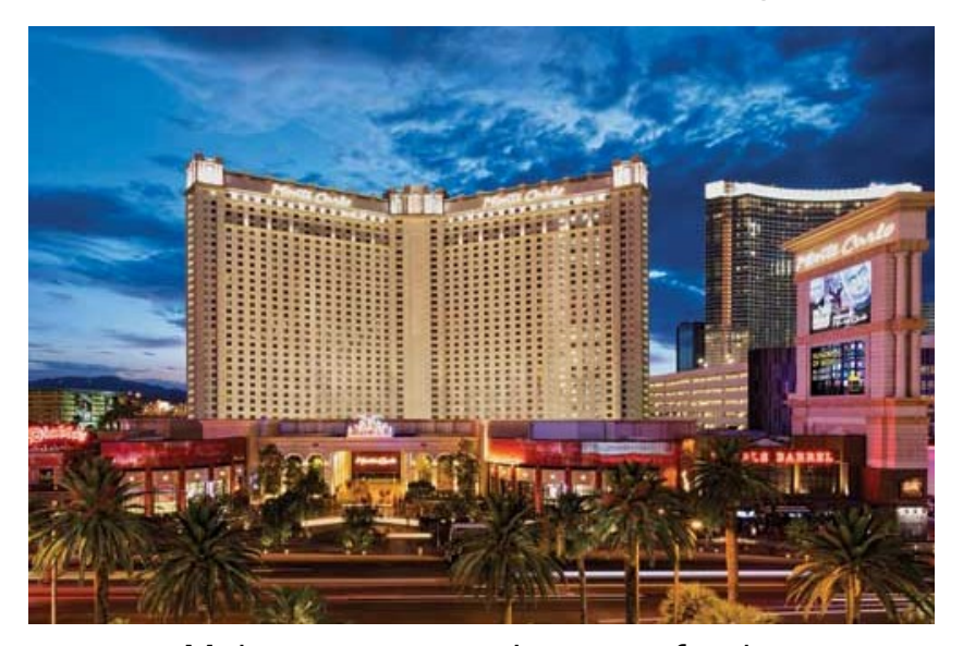
Make your reservations now for the